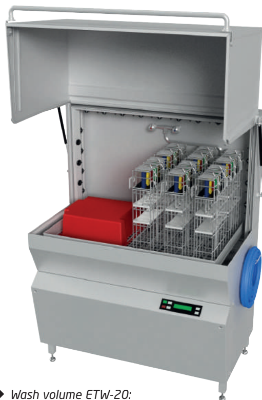
► Wash volume ETW-20: 645 x 1010 x 635 mm (hxwxd)