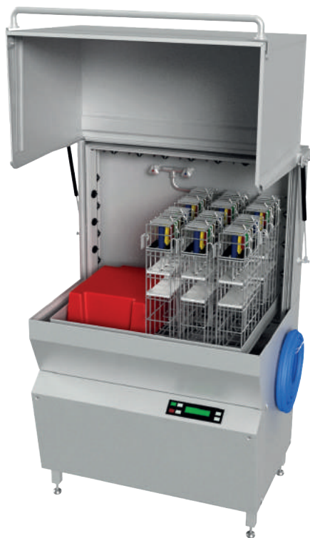
► Wash volume ETW-17: 640 x 810 x 635 mm (hxwxd)