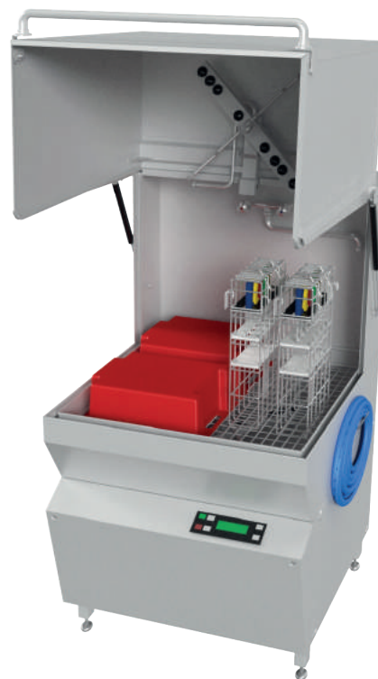
► Wash volume ETW-15: 610 x 810 x 635 mm (hxwxd)