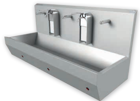
▶ Wash basin EWG-3 with optional soap dispensers