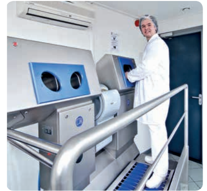
washing hands with the SANICARE-DYSON-B ▶