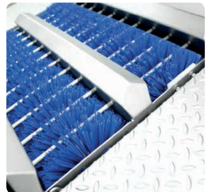
Sole cleaner DZW ▶ hygienic design