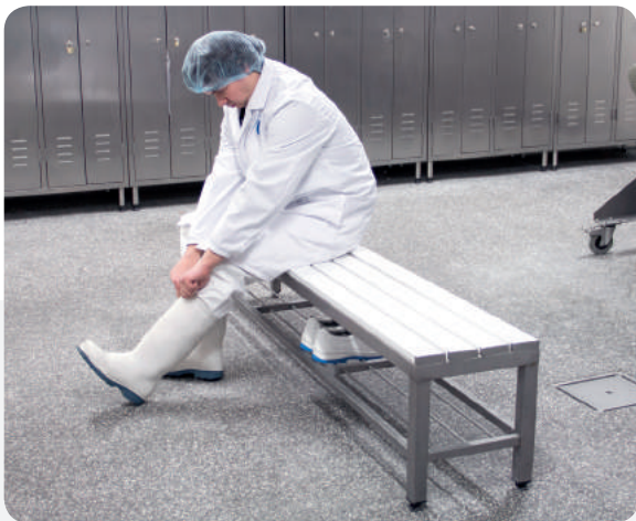
Stainless steel bench