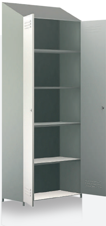
Storage cabinet FI-2003

The cabinets are available with a flat top and in widths of 350, 610, 910 or 1200 mm.