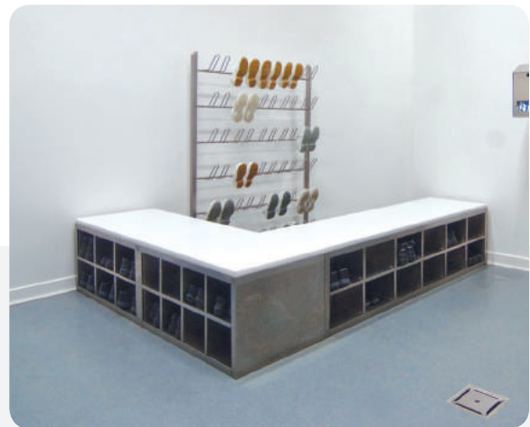
Stainless steel bench with compartments