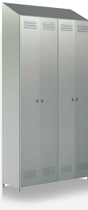
Clothing cabinet FI-1013

Executed with padlock or key-operated lock Adjustable