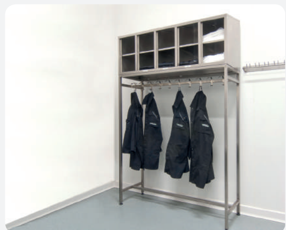
Wardrobe with cabinets