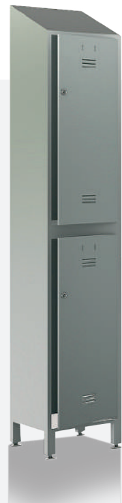
Clothing cabinet FI-1002-2

Executed with padlock or key-operated lock Adjustable