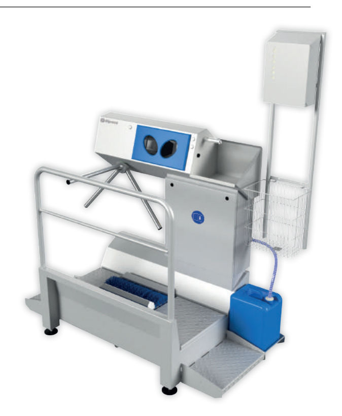
The SANICARE-500-B-R with optional paper dispenser and paper basket, ideal for small rooms.