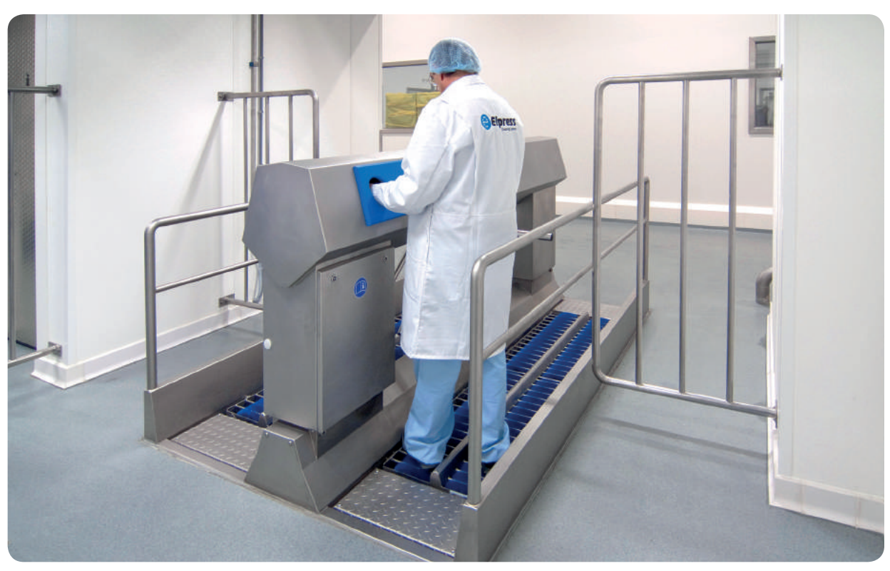
The COMBI-BB-DD-1500, built-in and connected to a centralised chemical supply.