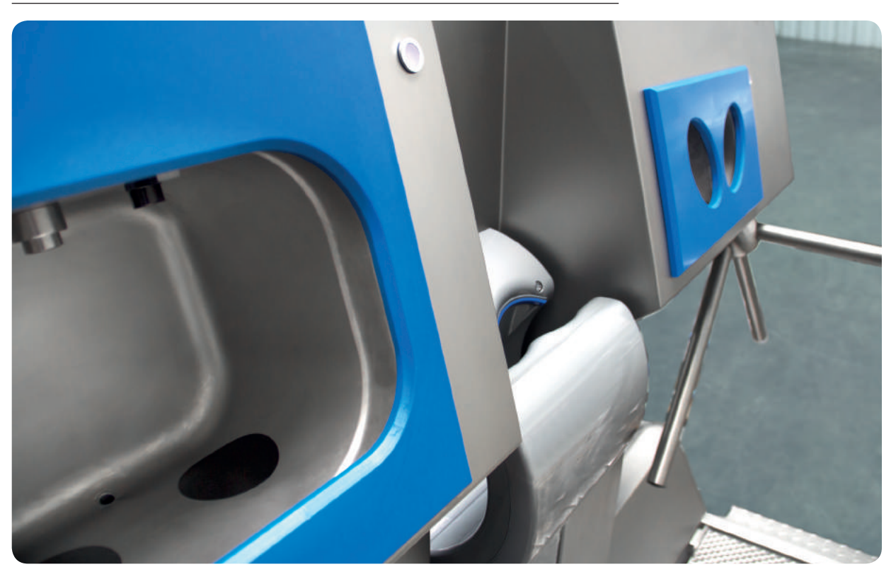
The SANICARE-DYSON-COMBI-BD-1500-L in practice.