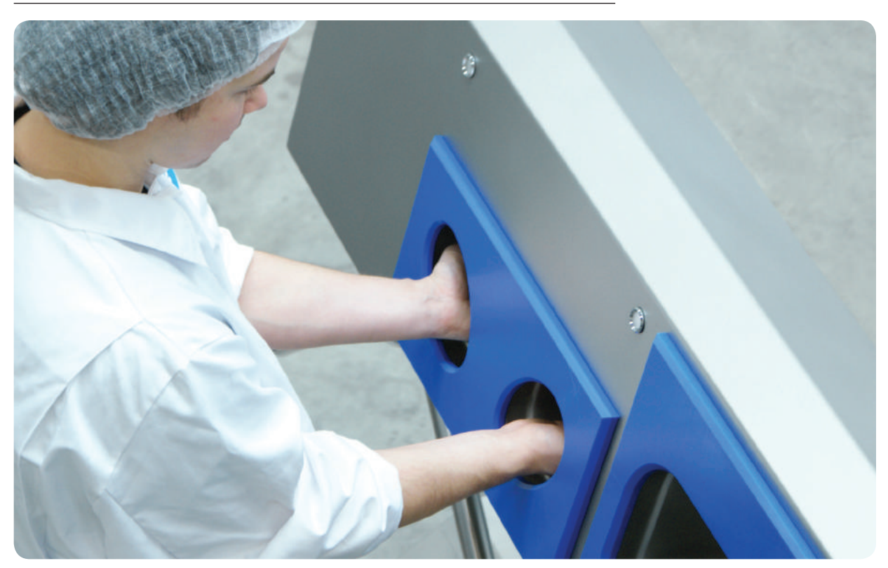
The SANICARE-1000-D-R in practice.