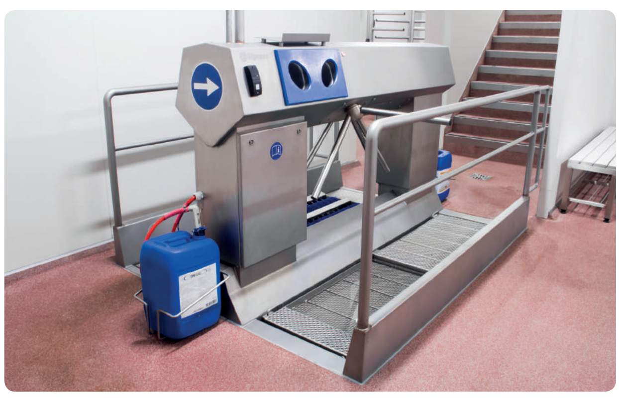
The COMBI-BD-D-1500-L, built-in, with optional time registration and document holder.