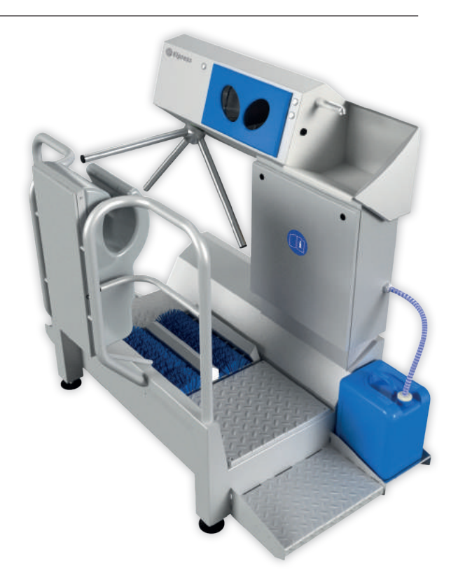
The SANICARE-DYSON-500-B-R, specially designed for small spaces.