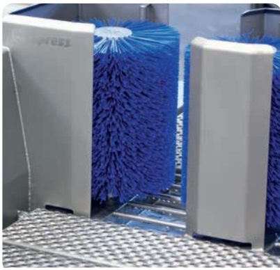
◀ Shaft cleaner EDSW