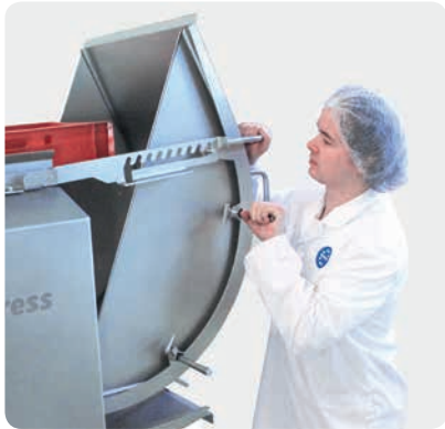
◀ EKW-2500 optional one-person operation