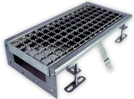
▶ Grid drains available in various sizes