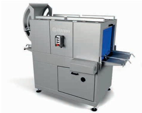
▶ Crate washer EKW-1500 the space-saving solution

modular structure for a wide range of uses