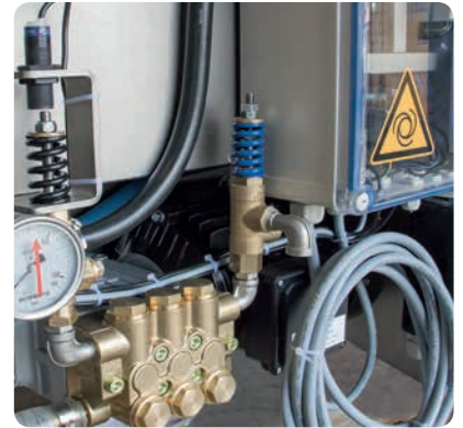
WMRA ▶ close-up of interior