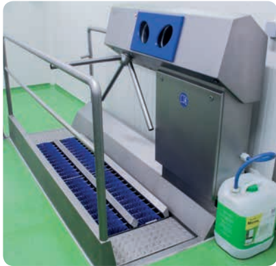
◀ DZW-HDT built into the floor