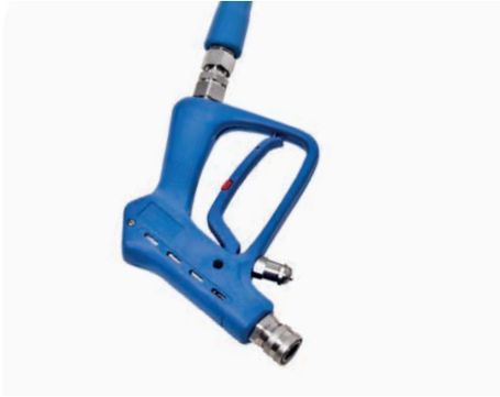
▶ Spray guns

expert advice, wide selection and fast delivery times