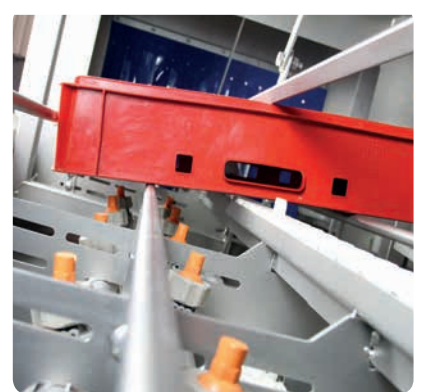
EKW ▶ inside