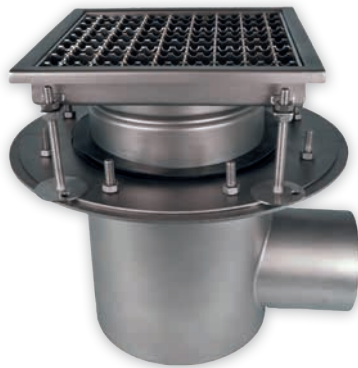
▶ Horizontal drains two-piece with square top