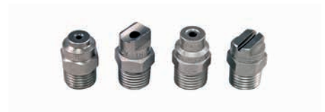
▶ Nozzles and spray heads