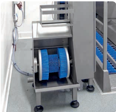
◀ Sole and shoe side cleaner EZR standing floor