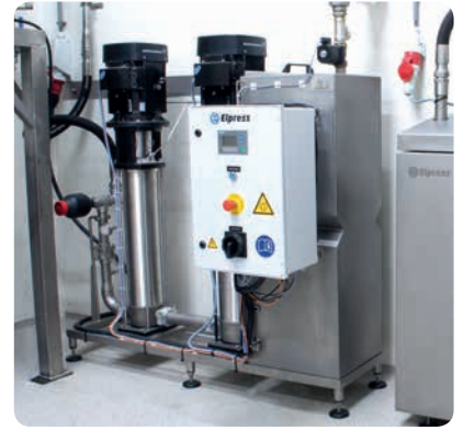
MDC 40-40 ▶ cleaning at 40 bar