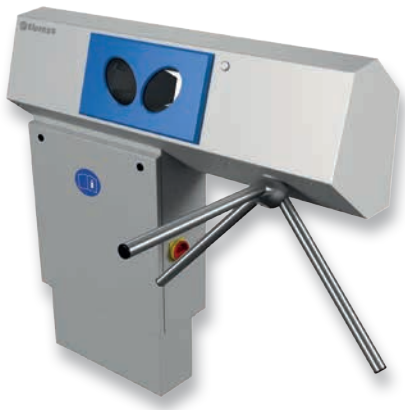
▶ HDT chemical dispenser with access control