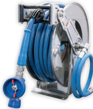
▶ Hose reel sets