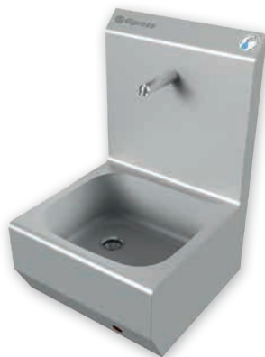
▶ Wash basin EWG-1-Deluxe with sensor or knee operation