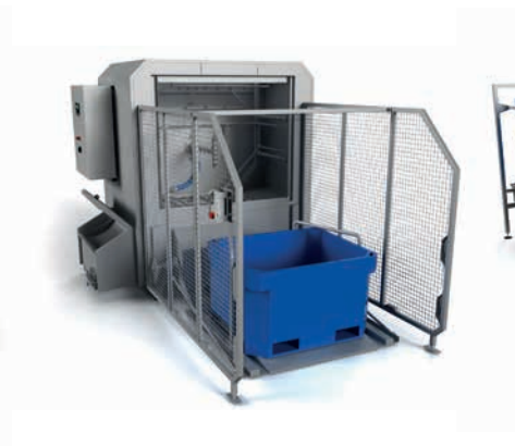
▶ Crate washer EDW-20 washes up to 20 crates per hour