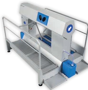
▶ COMBI-BD-DD-1500 sole cleaning and disinfection, hand disinfection and access control