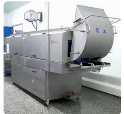
EKW-3500 ▶ with optional one-person operation