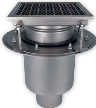
▶ Vertical drains two-piece with square top