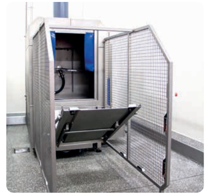
ENW-20 Plus ▶ wash 20 standard carts per hour