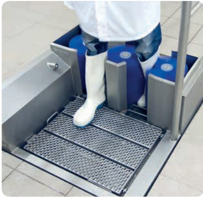
◀ Shaft cleaner EDSW built into the floor