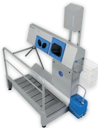
▶ SANICARE-D sole disinfection, hand washing, hand disinfection and access control