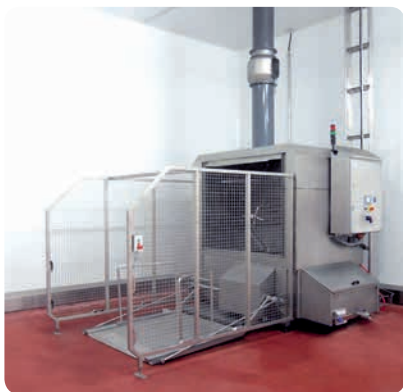
◀ EDW-20 wash 20 bins per hour