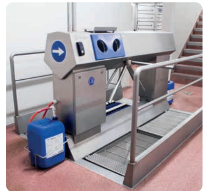
COMBI-BD-D-1500-L ▶ built-in model with optional time registration and document holder