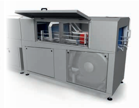
▶ Blower unit EAB-1-ST powerful fan blows away excess water