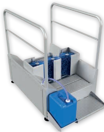
▶ EDSW shaft cleaning