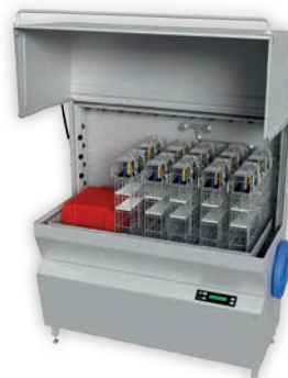
▶ Utensil washer ETW-30 for knife baskets, small crates and other utensils.