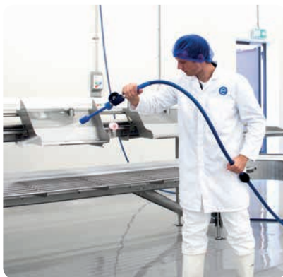
◀ Cleaning in combination with LDC-Q, satellite and reel set