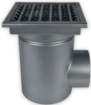
▶ Horizontal drains one-piece with square top