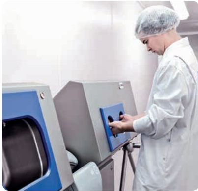
◀ disinfecting hands with the SANICARE-DYSON-B