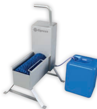
▶ EZW sole cleaning