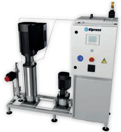
▶ Booster unit MDC cleaning at 40 bar, up to 16 users