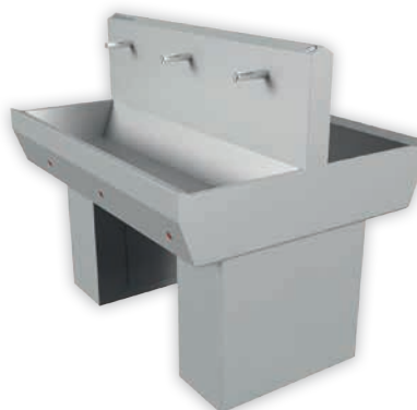
▶ Double wash basin EWG-3-D with sensor or knee operation