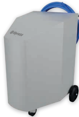
▶ MLDC-COMPACT mobile booster unit