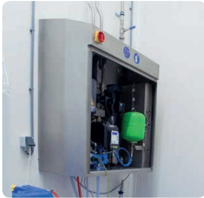
◀ CFD-Q provides users with a metered amount of foam and disinfectant