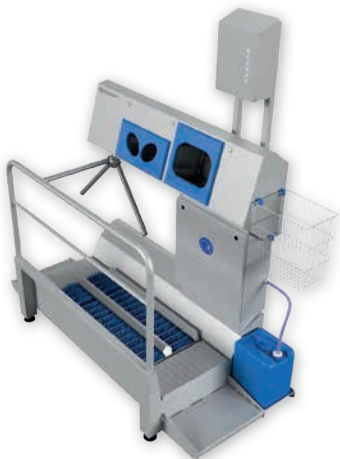
▶ SANICARE-B sole cleaning, hand washing, hand disinfection and access control