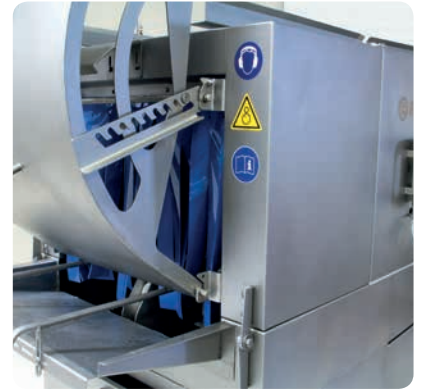
EKW-1500 ▶ with optional one-person operation