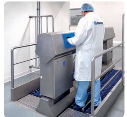
COMBI-BB-DD-1500 ▶ ideal for large throughput capacity