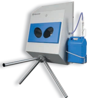
▶ HDT-WM chemical dispenser with access control