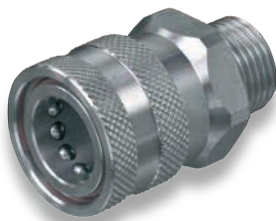
▶ Quick couplings, nipples, etc.