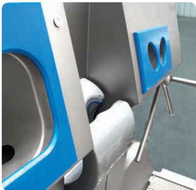
◀ SANICARE-DYSON-COMBI the all-in-one solution