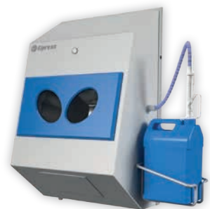
▶ HD-WM chemical dispenser