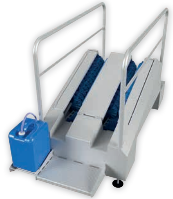
▶ DZSW sole and shaft cleaning