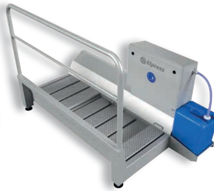
▶ DZD sole disinfection