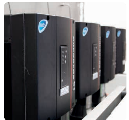
LDC-Q ▶ close-up of 400/20 model