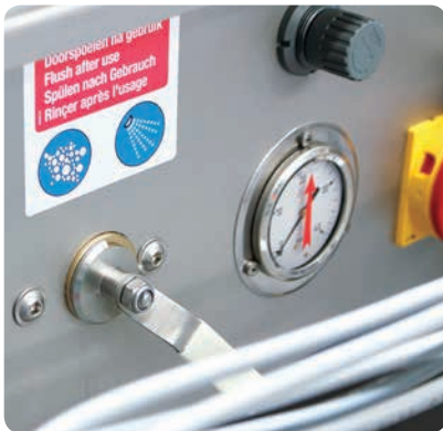
◀ MLDC-COMPACT easy to operate