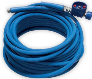
▶ Hose sets