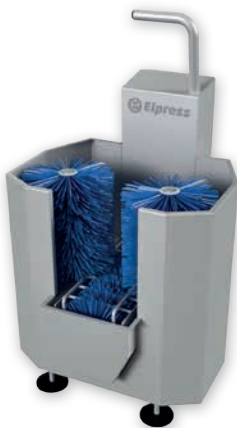
▶ EZSW sole and shaft cleaning