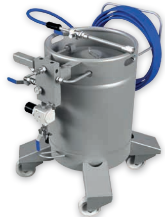
▶ Mobile foam tank S50-B mobile foaming, simple manoeuvring