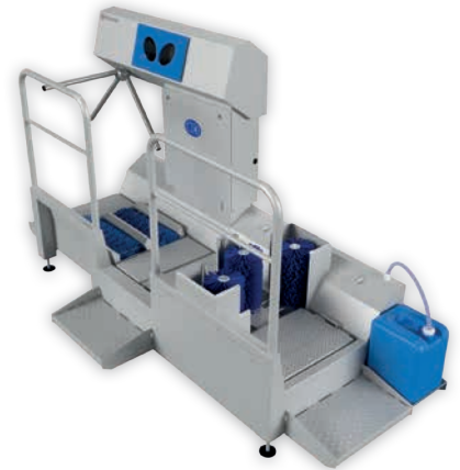
▶ DZW-HDT-EDSW sole cleaning, hand disinfection, access control and shaft cleaning