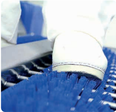
◀ Sole cleaner DZW 4-year warranty on brushes