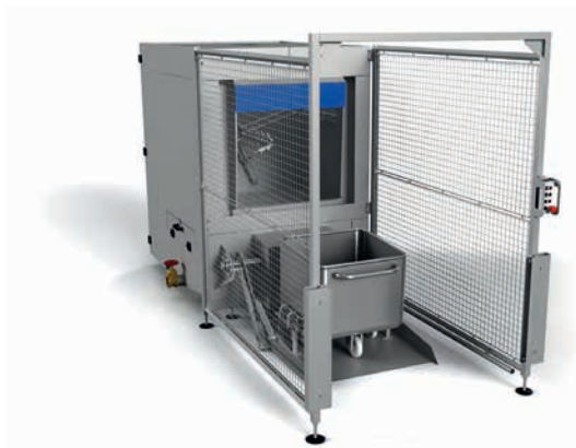
▶ Norm bin washer ENW-20 washes up to 20 standard carts per hour