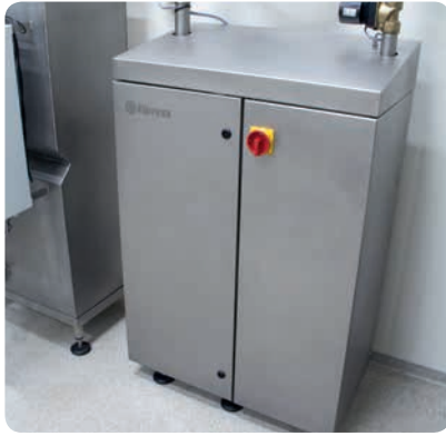
◀ LDC-Q 50 with optional housing