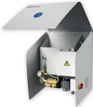
▶ Booster unit WMRA cleaning at 80 bar, for 1 user