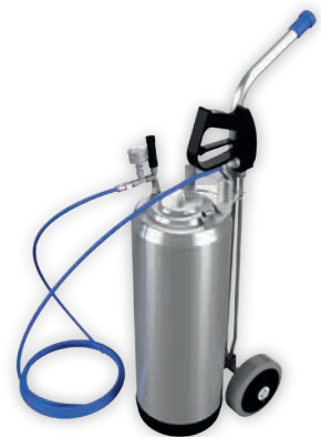
▶ Mobile disinfection tank MF-20 mobile disinfecting, simple manoeuvring