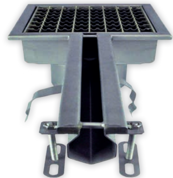
▶ Slotted drains available in various sizes