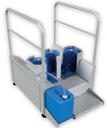
▶ EDLW sole and shaft cleaning