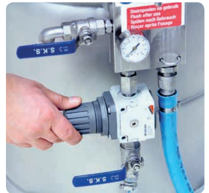
S50-B ▶ foam dosing easy to set