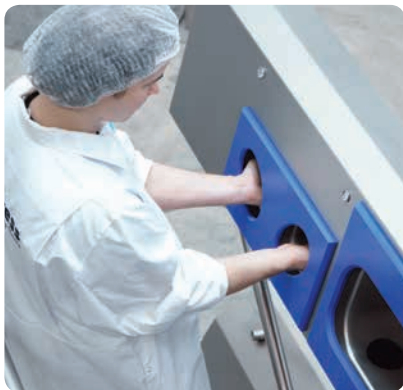
◀ disinfecting hands with the SANICARE-B