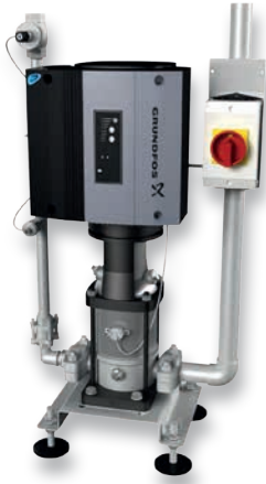
▶ Booster unit LDC-Q cleaning at 20 bar, up to 6 users