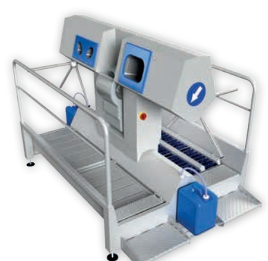
▶ SANICARE-DYSON-COMBI-BD sole cleaning and disinfection, hand washing, drying and disinfection with access control