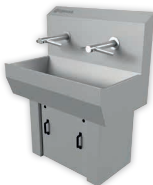
▶ Wash basin EWG-2S-TAP with sensor operation and integrated hand dryer