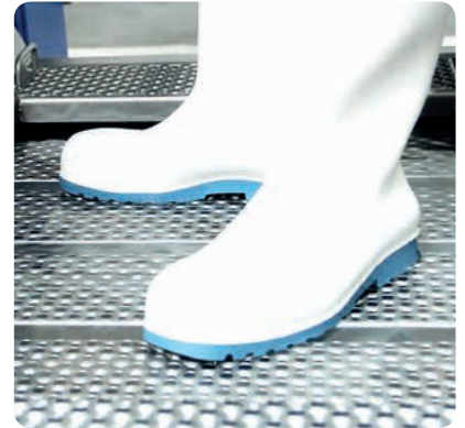
Sole disinfection DZD ▶