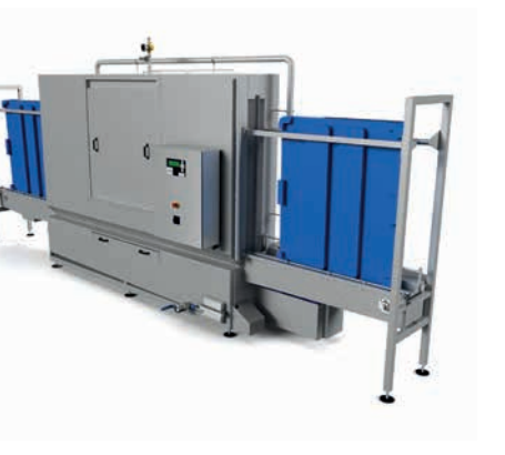
▶ Pallet washer EPW-45 for the washing and rinsing of pallets