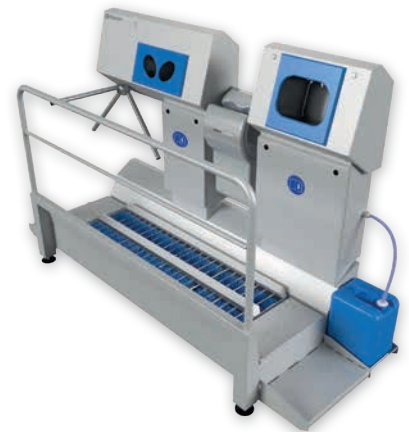
▶ SANICARE-DYSON-B sole cleaning, hand washing, drying and disinfecting with access control