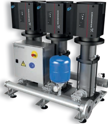
▶ Booster unit LDC-Q cleaning at 20 bar, from 8 users