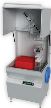
▶ Utensil washer ETW-10 for knife baskets, small crates and other utensils.