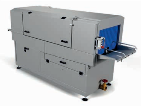
▶ Crate washer EKW-2500 washes up to 400 crates per hour