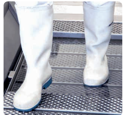
Sole disinfection DZD ▶