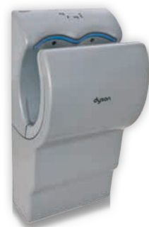
▶ Dyson Airblade™ in the colours grey and white