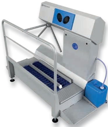
▶ DZW-HDT sole cleaning, hand disinfection and access control