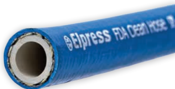
▶ Cleaning hoses