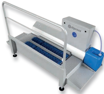
▶ DZW sole cleaning