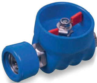
▶ Ball valves