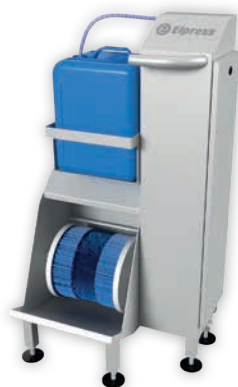
▶ EZR sole and shoe edge cleaner