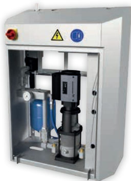
▶ Foam unit or disinfection unit CD/CF for a centralised supply of foam or disinfectant