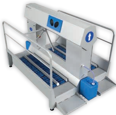
▶ COMBI-BB-DD-1500 sole cleaning, hand disinfection and access control for large throughput capacity