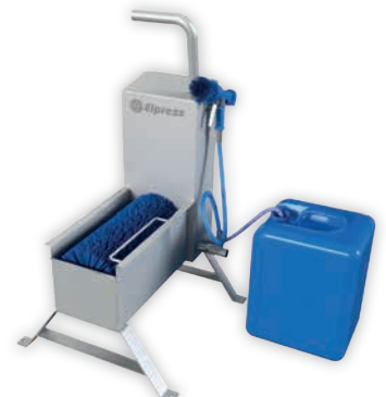
▶ ELZW sole and manual shaft cleaning