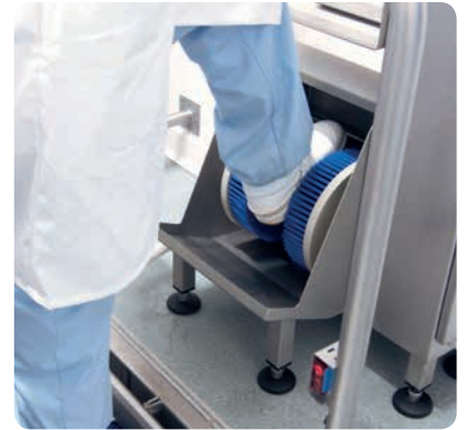
Sole and shoe side cleaner ▶ floor model