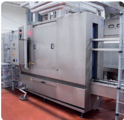
◀ EPW-45 with automatic feed and removal