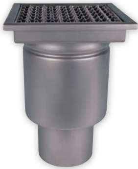
▶ Vertical drains one-piece with square top