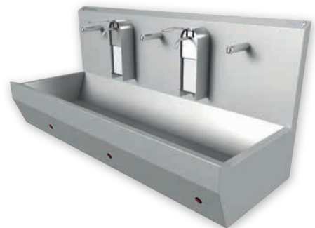
▶ Wash basin EWG-3 with optional soap dispensers