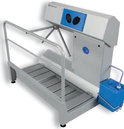
▶ DZD-HDT sole disinfection, hand disinfection and access control