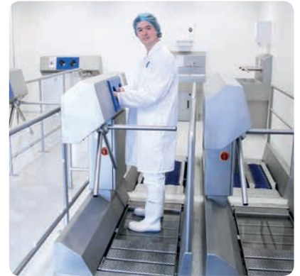
DZD-HDT ▶ built into the floor