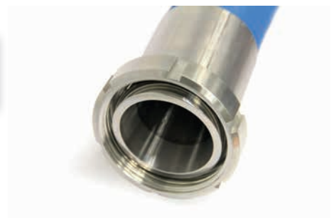
▶ Food grade hoses