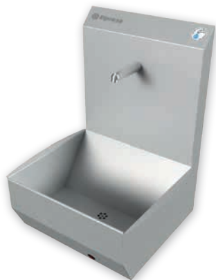
▶ Wash basin EWG-1 with sensor or knee operation